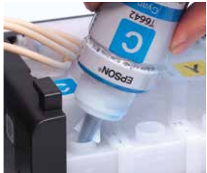
Smart tip design for easy, mess-free refills