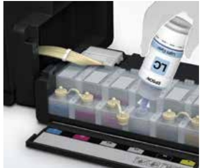
Specially fitted tubes ensure reliable ink flow without leakage

Epson's original ink tank system is engineered for easy, mess-free refills. The special tubes in the printer are designed to ensure smooth and reliable ink flow at all times.